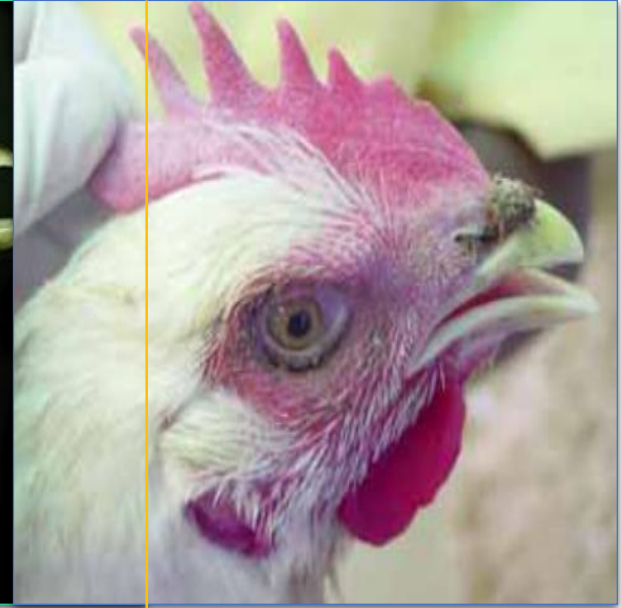
Infectious Bronchitis Virus (IBV)