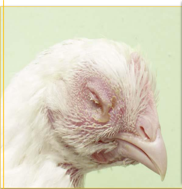
Infectious Laryngotracheitis (ILT)